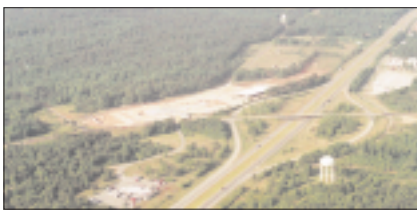
The Dry Pond exit in Jefferson where Hwy. 82 crosses I-85 is destined to be a major growth spot, as evidenced by the construction of a Freightliner facility in this photo. This view is looking south with I-85 heading toward Atlanta in the upper right of the photo. The land on the left of the photo is all designated for industrial development. The area is served by infrastructure from the City of Jefferson, as evidenced by the water tank in the top of the photo, and by the Jackson County Water and Sewer Authority whose water tank is in the bottom of the photograph.