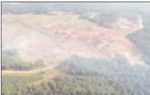
A hazy smoke from burning trees covers the area being cleared for the Bear Creek Reservoir in South Jackson. The huge lake will provide water to a four-county area.