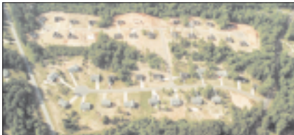
A ubiquitous site from the air is the growth in Jackson County subdivisions. Once scarce, subdivisions have become a common feature over the county's landscape.