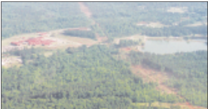
An unmistakable feature from the air is the route of the Jefferson bypass, currently under construction. Here, the route is shown as it passes Jackson County Comprehensive High School (left) crosses Hwy. 11 and passes by Crowe's lake.