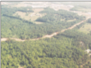
Cut through the trees is the route for an access road between Hwy. 98 and Hwy. 441 that runs parallel to I-85 near Commerce. The area is the location of a state industrial "mega-site" for growth.