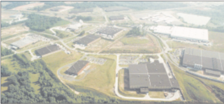
A key area of Jackson County industrial growth has been the I-85 & Hwy. 129 interchange in Jefferson. This area north of the interstate has been the site of massive industrial development during the last decade as new businesses have flocked to the area. In this photo, the interchange is out of the frame in the upper right and Hwy. 129 runs north to the upper left of the photo.